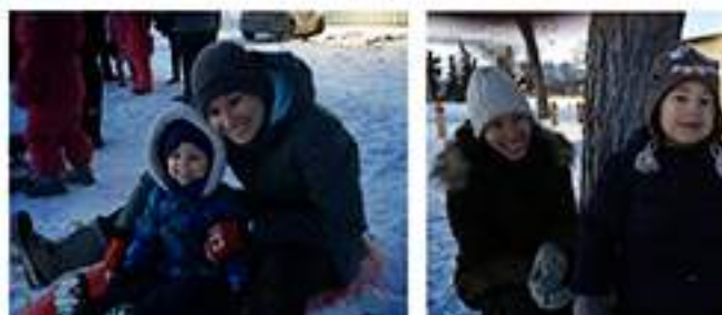
Fun at the New Year's Day Party!