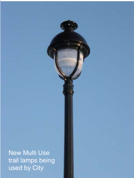
New Multi Use trail lamps being used by City