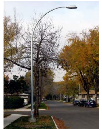
New Unpainted Galvanized style shown above....New upgraded styles shown below